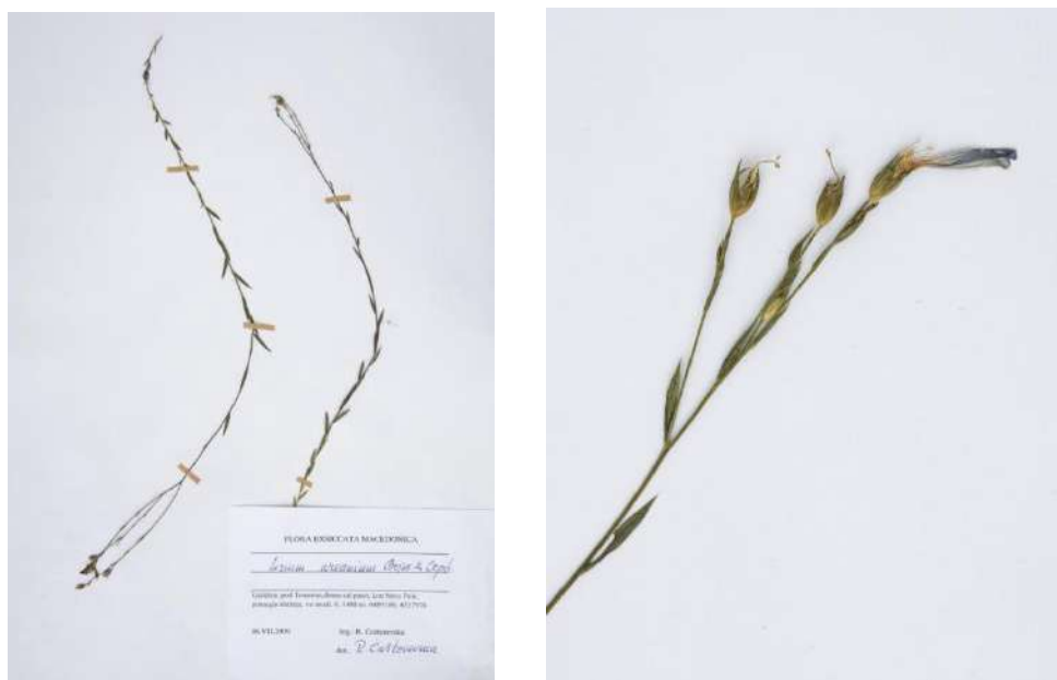
Figure 7. Linum aroanium Boiss. & Heldr. - Galičica: Tomoros