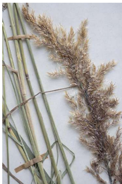
Figure 13. Calamagrostis pseudophragmites - Prilep: Mariovo-v. Bešiste