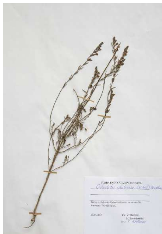
Figure 10. Odontites glutinosa - Prilep: Debrešte-Debreška Krasta

Within the territory of North Macedonia, Odontites glutinosa is considered a rare plant species. So far, it has only been documented in a few medium-high mountains, such as Luben, Kozjak-Pletvar, and Vodno. Typically, it is found in the belt of hilly pastures, similar to the newly discovered locality of the species on Debreška Krasta, near Prilep.