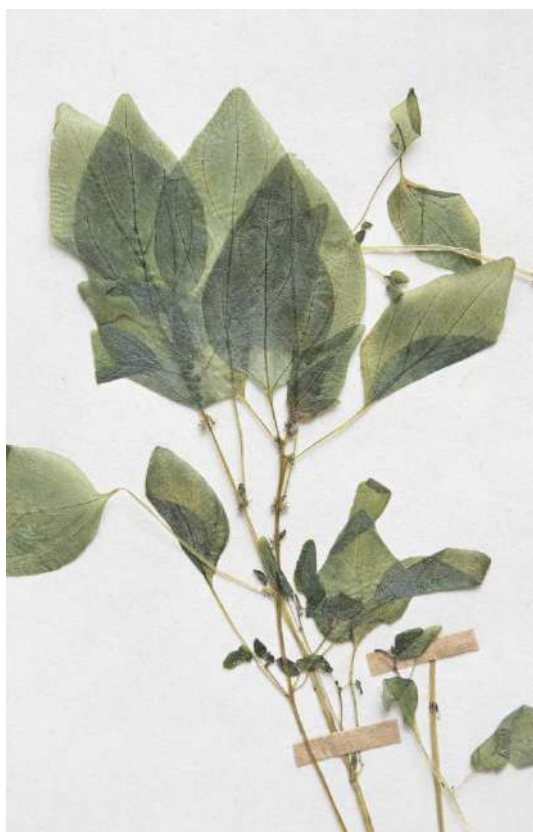
Figure 11. Parietaria lusitanica - Bitola - Mariovo: v. Grunište

This amphibious plant species, widely distributed in the northern hemisphere, has a highly restricted range within the territory of North Macedonia. Previous data indicated that Hippuris vulgaris was solely known to exist in wetlands along Ohrid Lake and in the vicinity of Strumica [6]. However, recent investigations have confirmed its presence in Lake Ohrid and revealed another newly discovered locality near the village of Stracin, in the vicinity of Kratovo.