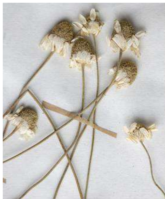
Figure 3. Anthemis auriculata - Kavadarci: Mrzen

According to the Euro+Med Plant Base, Anthemis auriculata is known to have a restricted distribution in the Eastern Mediterranean and the southern regions of the Balkan Peninsula [AE (G) Bu Gr Mk Tu (A E)]. It is an intriguing and uncommon plant species with a limited range within the territory of North Macedonia. A new locality of this species has been identified in the central part of North Macedonia, specifically in Kavadarci - v. Mrzen. Recently, it has been the subject of diverse phytochemical research [22, 23].