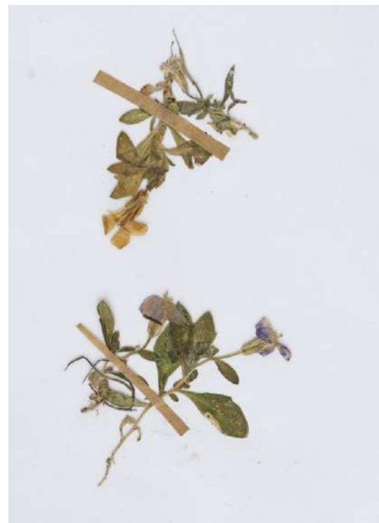
Figure 5. Aubrieta gracilis subsp. scardica (Wettst.) Phitos - Galičica: Kazan