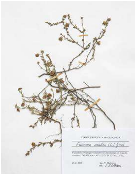
Figure 4. Fumana arabica - Valandovo - Valandovsko Brdo

Fumana arabica is naturally found in the southern part of Europe, ranging from Sardinia to Crimea. Previously, its presence in Macedonia was only documented in the vicinity of Dojran-v. Nikolic, as reported by Bornmuller [24] and Micevski [4]. However, the recent discovery of a locality near Valandovo confirms the continued existence of this taxon approximately 90 years later.