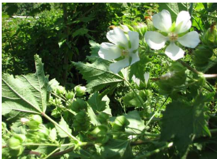
Figure 8. Kitaibela vitifolia - Jablanica: Vevčani

are found in valleys and gorges, which are recognized as significant refuges for Tertiary plant species in the Balkan Peninsula. However, according to Stevanovic et al. [29], the habitats of this species are primarily anthropogenic in nature. These habitats include roadsides, vineyards, low scrublands, and the edges of degraded forests. This suggests that the occurrence of K. vitifolia is largely influenced by human activity. Consequently, K. vitifolia can be considered an element of the Tertiary flora that has successfully adapted to anthropogenic environments. Recently, similar habitats supporting this species have been discovered in Jablanica Mountain, near v. Vevčani, along forest roads within degraded beech and chestnut forests.