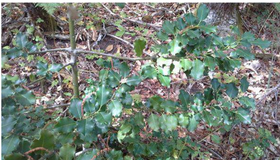
Figure 2. Ilex aquifolium - Jablanica Mt.: Vevčani

To date, all recorded occurrences of this Mediterranean-Atlantic species within North Macedonia have been limited to the Vardar River and its tributaries, making them part of the Aegean catchment area. The vicinity of Vevčani (Jablanica Mountain) represents the sole known locality of this species in the western and southwestern regions of Macedonia, which falls within the Adriatic catchment area.