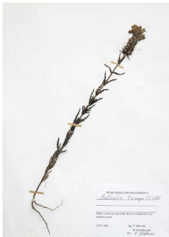
Figure 9. Bellardia trixago - Prilep: Debrešte-Debreška Krasta

This plant species is exceptionally rare within the territory of North Macedonia and was previously known only in the vicinity of the city of Bitola [20]. However, recent discoveries have revealed its presence in three additional localities near Prilep, specifically in v. Debrešte, v. Krivogaštani, and Selečka Mountain.