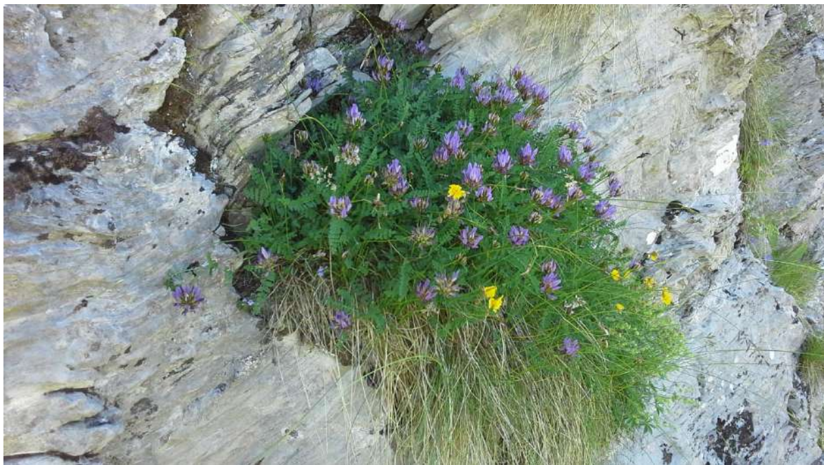
Figure 6. Astragalus hypoglottis subsp. gremlii - Jablanica: Vevčansko lake, Golina

New locality is registered on Jablanica mountain (near Podgorečko and Vevčansko lake).