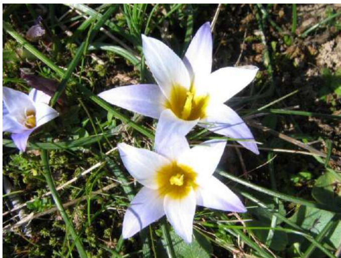
Figure 12. Romulea bulbocodium - Dojran: Debrešte-Nikolič

In the Flora of Macedonia, the genus Parietaria is represented by three species: Parietaria officinalis , P. diffusa , and P. lusitanica [3]. The first two species are widespread throughout the territory, while P. lusitanica is an extremely rare plant, previously known from only a few localities. However, the distribution range of P. lusitanica in North Macedonia has expanded with the discovery of a new locality in the Mariovo area, near the village of Grunište. This species thrives beneath large granite rocks within the Crna Reka gorge, under the influence of a sub-Mediterranean climate.